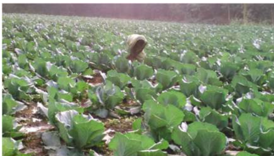
Promotion of Vegetable Cultivation by SHGs in Bangriposi Block

With support from Heifer International India, NYDHEE has implemented Mayurbhanj Socio-economic Development Project in Bangriposi block of Mayurbhanj District from 2014-2020 covering 5010 BPL Households, 433 SHGs. This is one of the major project of NYDHEE in livelihood intervention implemented with goal of alleviate extreme poverty among the small holder farmers in Mayurbhanj through a holistic approach addressing Enhanced Livelihood and Income, Improved Nutrition and Food security, better Environmental Practices, Women Empowerment and building Social Capital.