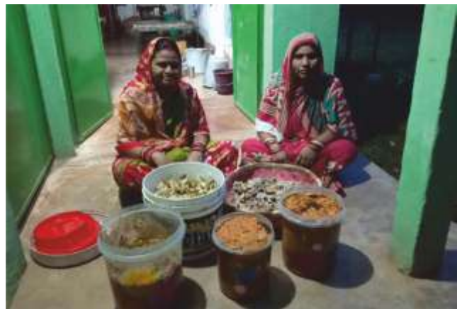
SHG Member Engaged in Various IGP activities