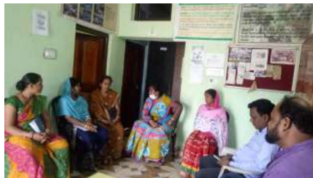
Meeting of DFPCL DBOD members