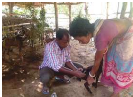
Goat immunization by Paravet

The project activities like vaccination support, physical inputs, and training on improved animal management, fodder development, collective marketing and marketing linkage helped 70% of the project participants to become goat based entrepreneurs. The goat value chain model practiced in the project area has enhanced the income of 3500 plus families by INR 55000 per annum. They have increased knowledge on animal management which reduced the goat mortality to 0.17%. The improved market linkage through the