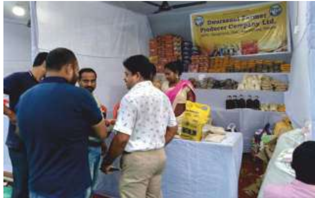
DFPCL Participated in AdivasiMela at Bhubaneswar

Under the MSED project, the programmatic intervention in the community emphasis on a holistic approach comprising I) Enhanced income and livelihood through the goat value chain II) Fodder management and cultivation for sustainability III) Improved nutrition and compliment family income through Kitchen Garden IV) Backyard Poultry for nutrition and complementing family income.