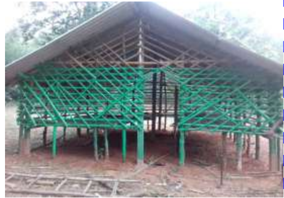
Model Goat Shed prepared by the community

Through Model Goat shed promotion activities, 06 (community) and 725 (Individual) goat shed have been built covering 79 villages benefiting 815 households.