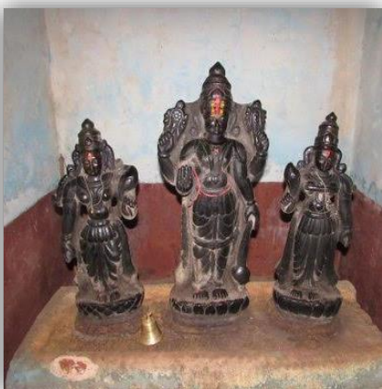
Channakeshwara, Sridevi & Bhodevi