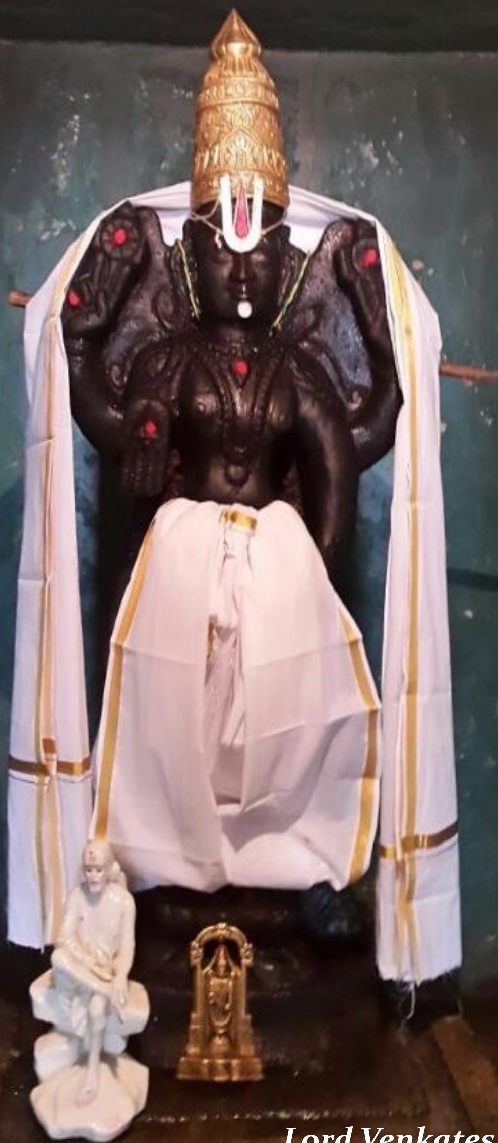
Lord Venkateshwara The Presiding Deity at the temple