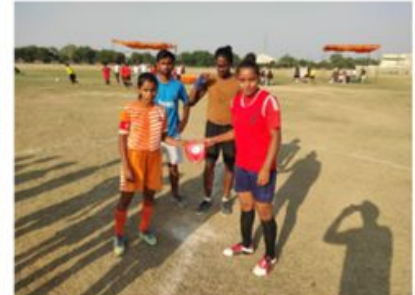
Players in action during Mohalla League & friendly matches