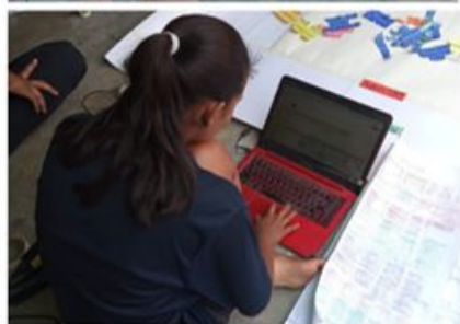
Top Row- Community council election in process ::: Bottom row- Student groups busy in their responsibilities