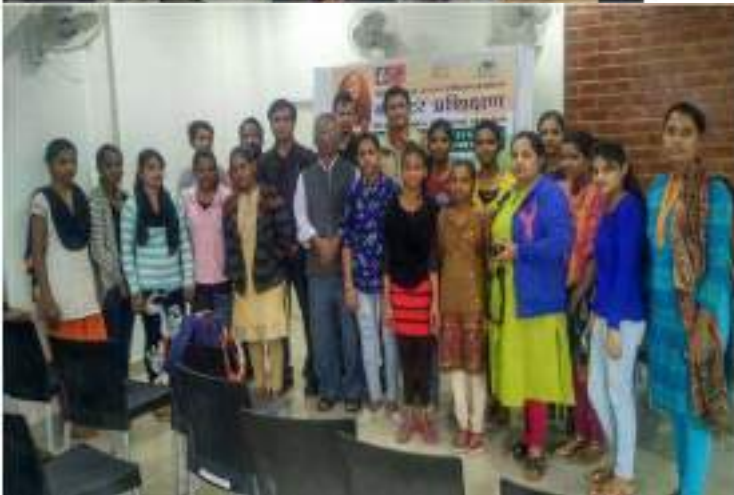
(Inauguration of computer training programme from 28 th November, 2018 to 27 th March, 2019 supported by Nehru Yuva Kendra Sanghatan, Ministry of Youth and Sports Affairs)