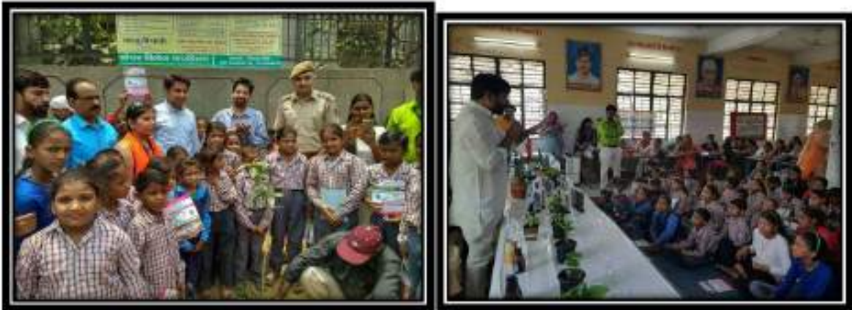
(Community event organised by Mahila Panchayat, JJ Colony Bakkarwala Village, Delhi on 5 th June, 2019 #beatplasticmovement)