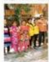
जयपुर संवादक के साथ टिका-जगान के कार्यक्रमों में शामिल लोगों ने जगह-जगह में स्वच्छता के लिए टिका-जगान का काम शुरू किया है।