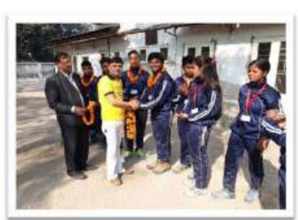
(Youth Empowerment through various awareness and training programmes)