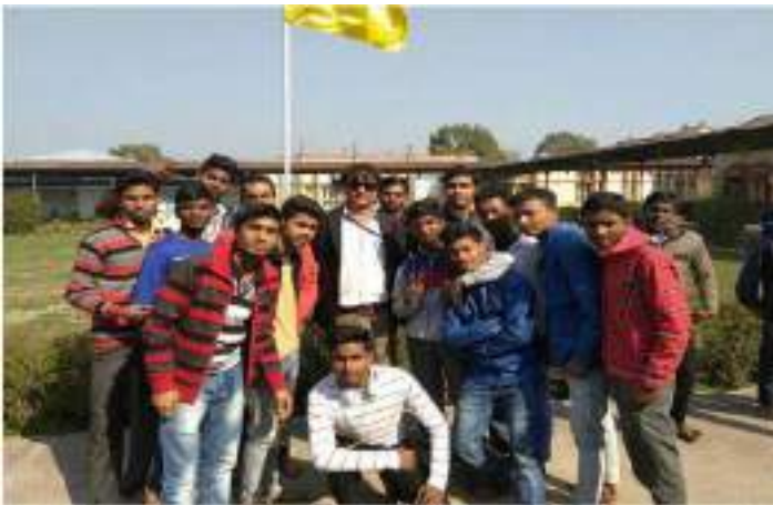
(12 th to 19 th January 2019 National Youth Week Observance in collaboration with Nehru Yuva Kendra Sanghatan, Ministry of Youth and Sports Affairs)