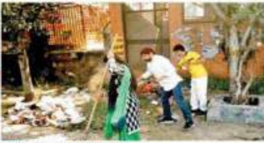
जयपुर संवादक के साथ टिका-जगान के कार्यक्रमों में शामिल लोगों ने जगह-जगह में स्वच्छता के लिए टिका-जगान का काम शुरू किया है।

जयपुर संवादक, धीरवी दिल्ली : जहाँ जहाँ के, वहीं पर स्वच्छता के लिए टिका-जगान हम एक दिन का मिशन 1000 टन में लोगों के जुटने का परिणाम लाने की योजना से जगह-जगह में लोगों ने टिका-जगान का काम शुरू किया है। जहाँ जहाँ के, वहीं पर स्वच्छता के लिए टिका-जगान हम एक दिन का मिशन 1000 टन में लोगों के जुटने का परिणाम लाने की योजना से जगह-जगह में लोगों ने टिका-जगान का काम शुरू किया है।