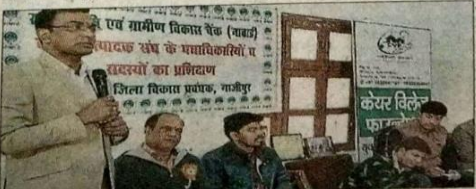
मरदह ब्लॉक के पास राष्ट्रीय कृषि एवं ग्रामीण विकास बैंक नाबाई की ओर से आयोजित प्रशिक्षण कार्यक्रम में शामिल अतिथि।