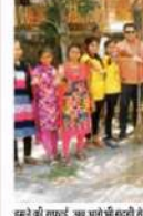
हमने जो सफाई, अब अपने भी सफाई में। स्वच्छता की शक्ति को लेन।