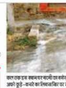
कारक इस स्वच्छता मिशन में शामिल हुए हैं।

जिन जगहों को साफ किया जा रहा है अब वहां का सुंदरीकरण होगा। जागरण के मिशन 1000 टन में लोगों के जुड़ने का निर्देश जारी है। रोजगार जोड़ने और हाथ मिलाने का निर्देश जारी है। रोजगार जोड़ने और हाथ मिलाने का निर्देश जारी है।