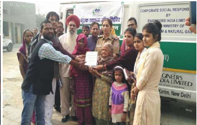
(Health Camp organised on 9 th November 2017 – CSR Initiative by Engineers India Limited (Navratna PSU under the Ministry of Petroleum and Natural Gas)