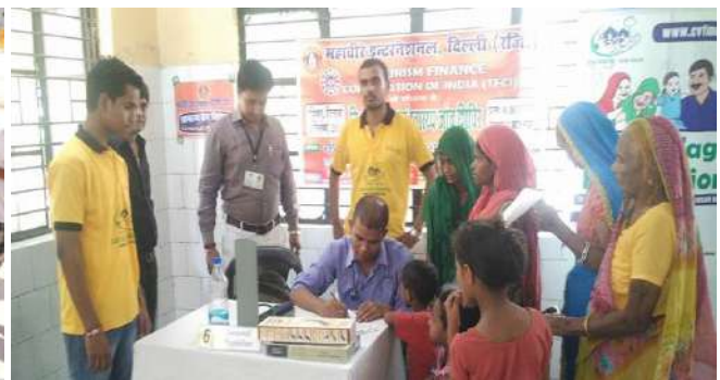
(Health Camp organised on 11 th September 2016 – in collaboration with Tourism and Finance Corporation of India (TFCI))