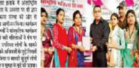
महिला हिंसा के अंतर्गत पारंपरिक रूप से महिलाओं को स्वयं आना होगा आगे