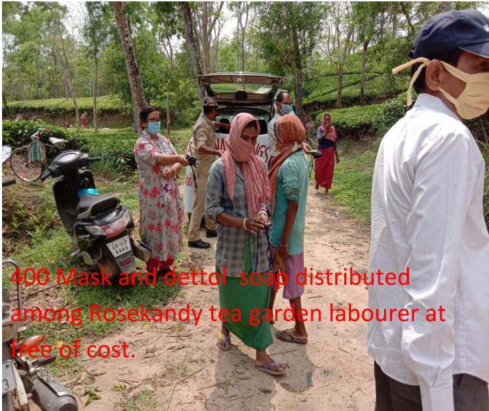
400 Mask and dettol soap distributed among Rosekandy tea garden labourer at free of cost.