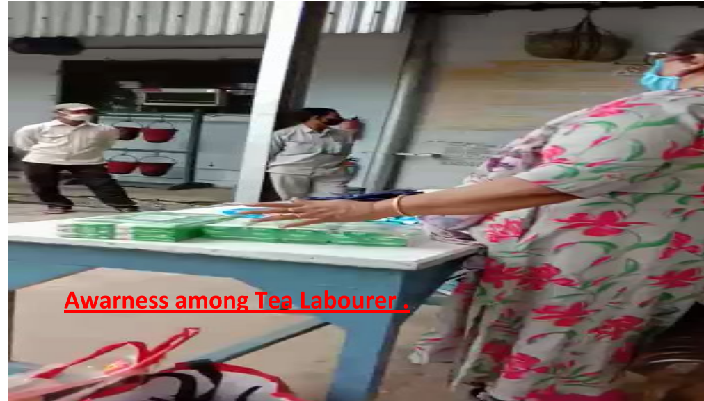
Awariness among Tea Labourer.