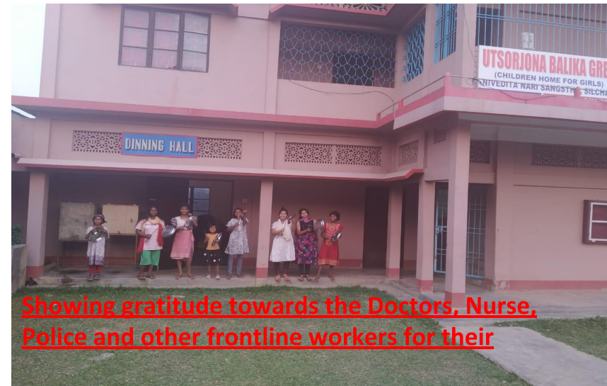
Showing gratitude towards the Doctors, Nurse, Police and other frontline workers for their