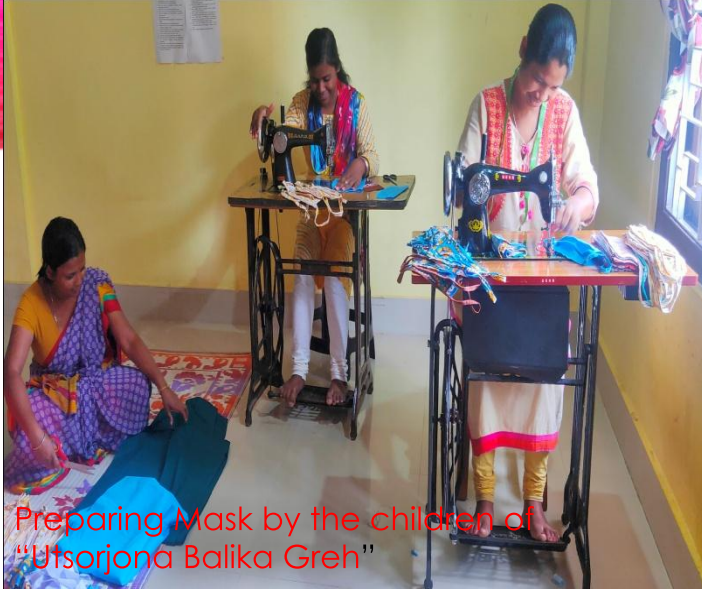
Preparing Mask by the children of "Utsorjona Balika Greh"