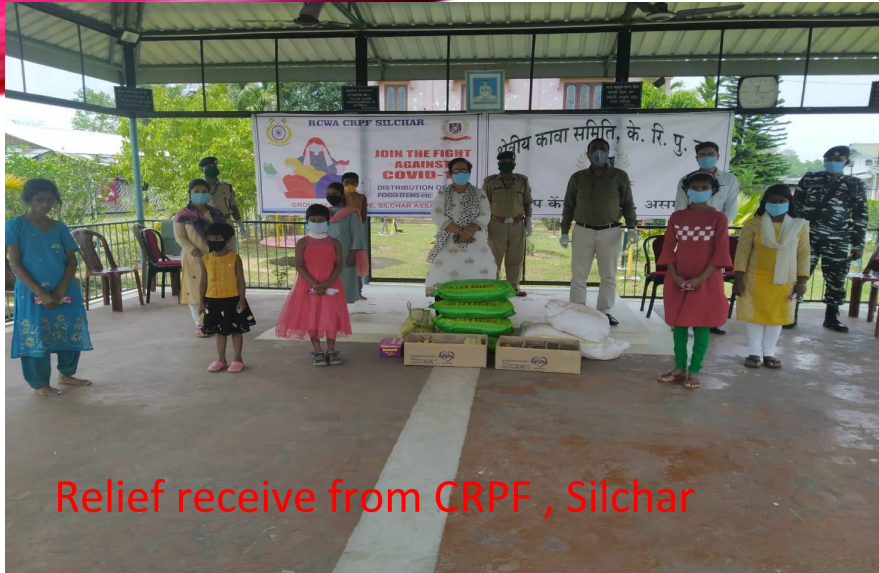
Relief receive from CRPF , Silchar