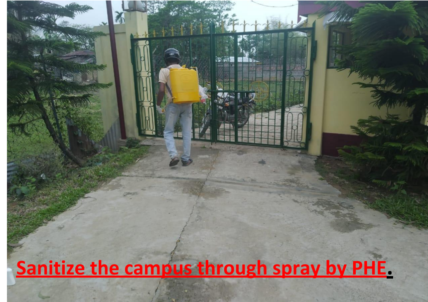
Sanitize the campus through spray by PHE.