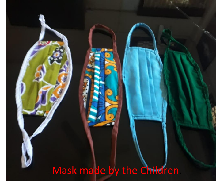
Mask made by the Children