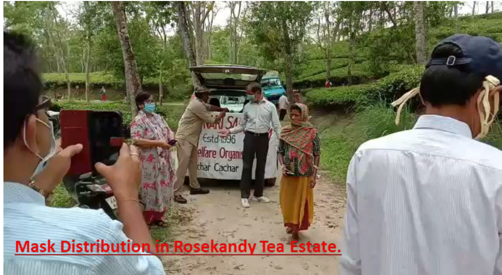
Mask Distribution in Rosekandy Tea Estate.