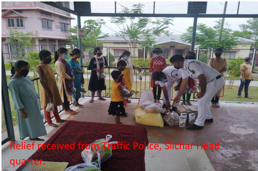
Relief received from Traffic Police, Silchar Head quarter.