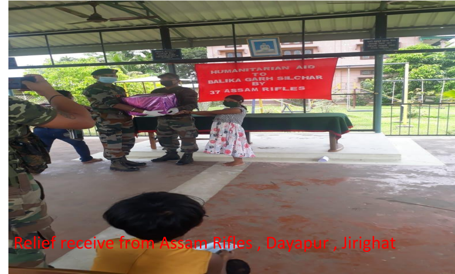
Relief receive from Assam Rifles , Dayapur , Jirighat