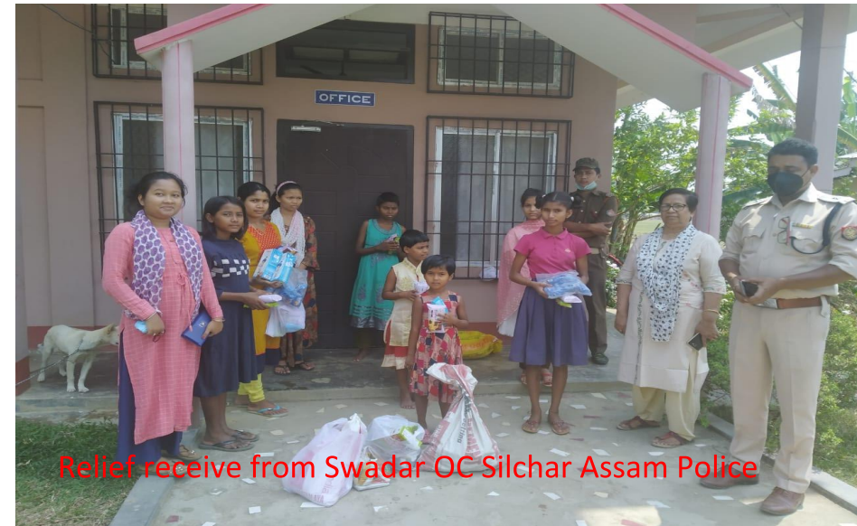
Relief receive from Swadar OC Silchar Assam Police