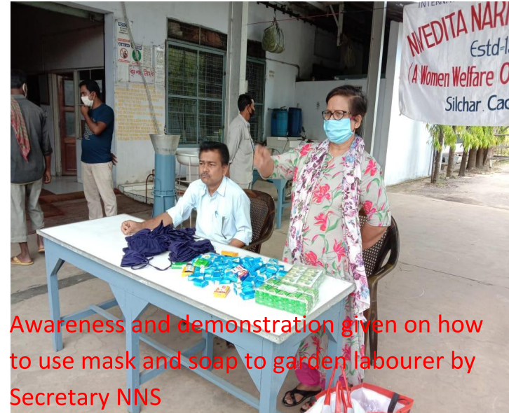
Awareness and demonstration given on how to use mask and soap to garden labourer by Secretary NNS