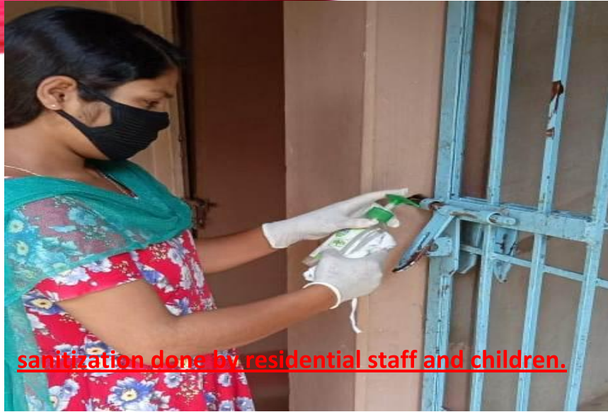
sanitization done by residential staff and children.