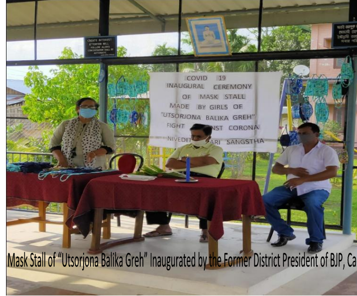
Mask Stall of "Utsorjona Balika Greh" Inaugurated by the Former District President of BJP, Cachar.