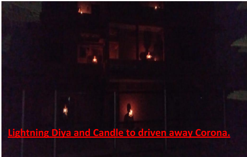
Lightning Diya and Candle to driven away Corona.