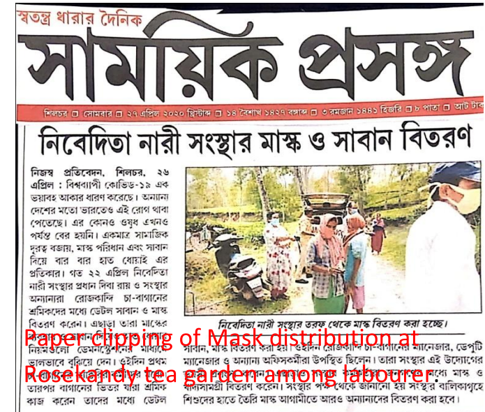
Paper clipping of Mask distribution at Rosekandy tea garden among labourers.