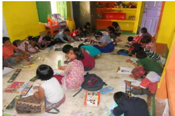
Activities of school sports, Debate competition & Drawing competition in Love Dale School.