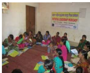
Potential Leadership Workshop