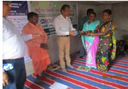
Community investment support