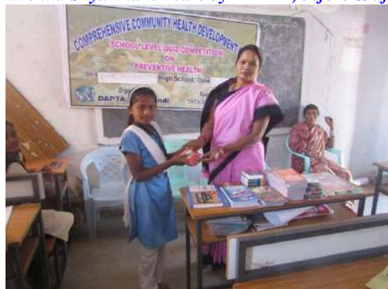
SCHOOL QUIZ COMPETITION