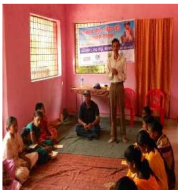
Sensitization Infant survival on child right