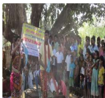
Street Play On Sweep Campaign