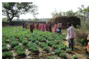
Community Exposure visit