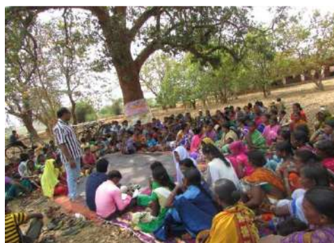
Mass sensitization meeting