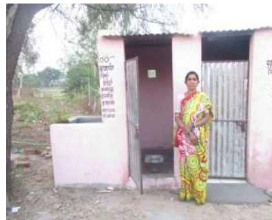
Construction of sanitary latrine under