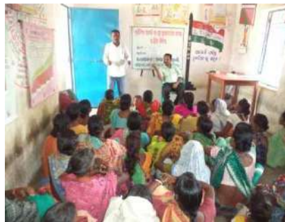
Training to women farmer