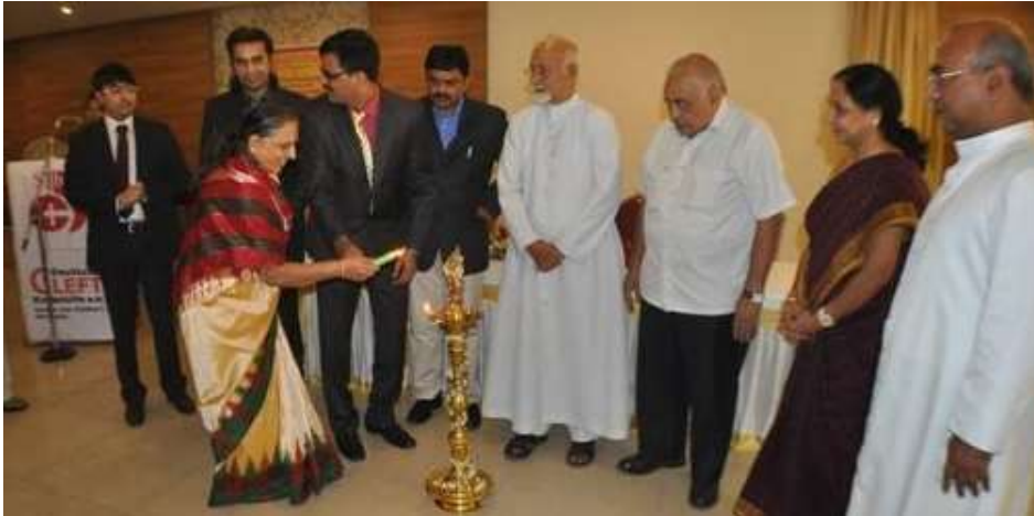
November, 2014 - Workshop on Anaesthesia for Cleft Surgery, Mysore