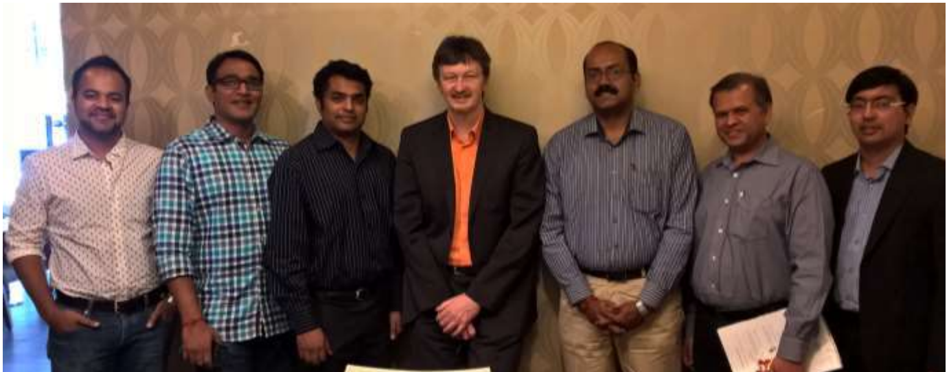
General meeting of the members of ABMSS was held in Bangalore on the 24th of February 2015