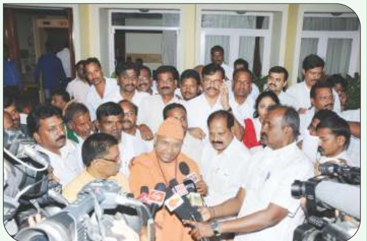
Thousands of people from Pavagada thronged Bangalore in a show of solidarity before the Chief Minister