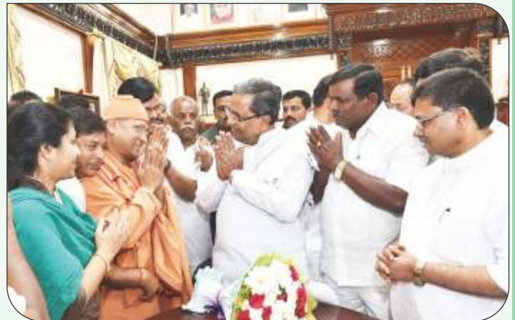
Rev. Swamiji speaks up before the Chief Minister Sri Siddaramaiah

Further details on the project have indicated the government's resolve to fast track this project. Work is proposed to be begun at both ends of the pipeline, and adequate amounts are being sanctioned.