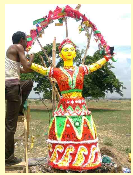
Tribal mother-figure at fair