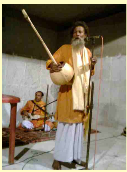
Folk song - Baul