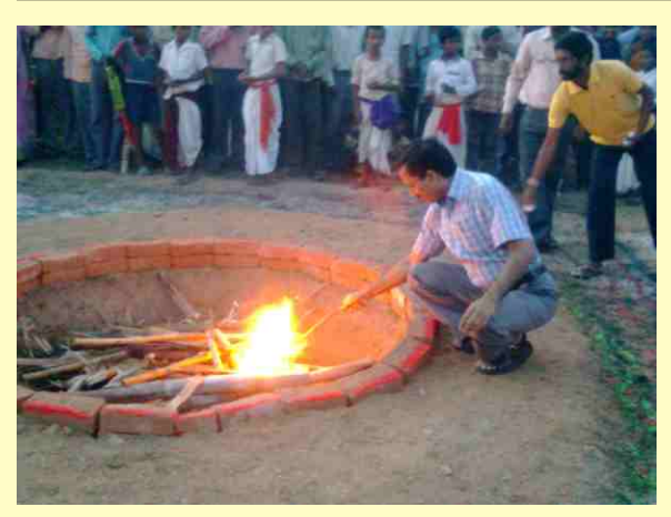
D.M. lights inaugural fire