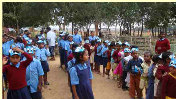
Regular attendance in school at Para, Purulia