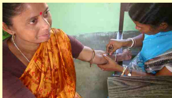
For pathology test

Our Urban Health Unit, Swami Lokeswarananda Smarak SevaKendra (SLSS), at Baranagar, has been functioning from 2001 catering about 2.5 lac population in the slums of Baranagar and Kamarhati. Urban activities include: