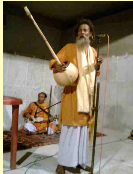
Folk song - Baul