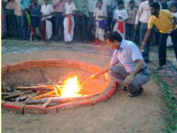
D.M. lights inaugural fire