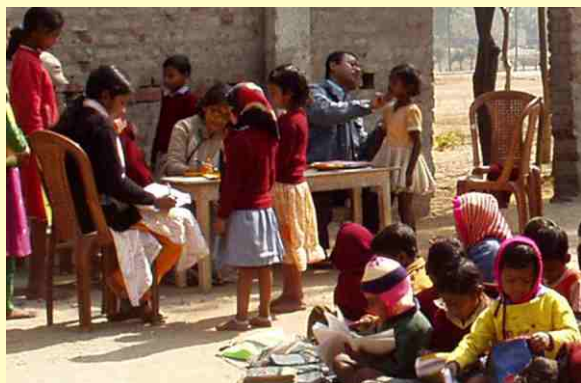
School health check-up