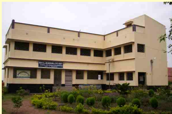
Lokeswarananda Eye Foundation