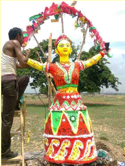
Tribal mother-figure at fair