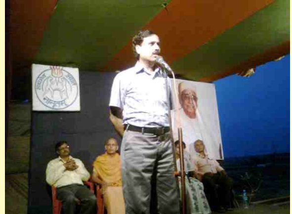
D.M. addresses the gathering