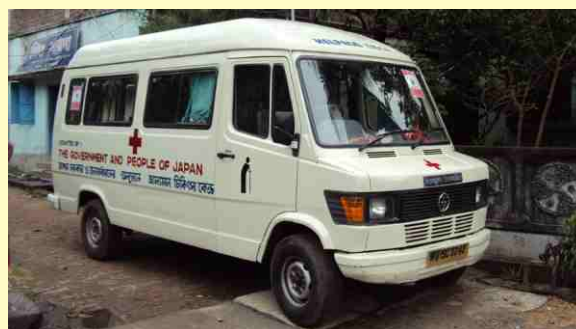
SLSS Mobile Unit