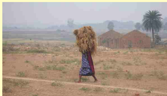
Occupied with daily chores