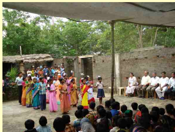
Cultural programmed by students