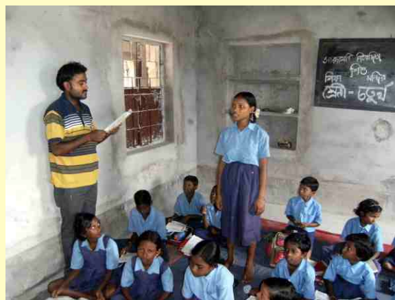
Class in progress