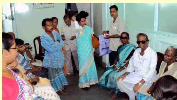
Patients waiting at SLSS