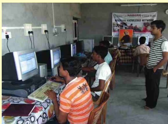
Microsoft Unlimited Potential Programme