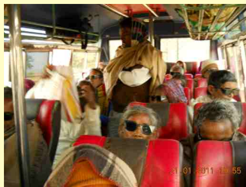
Transport arranged for patients