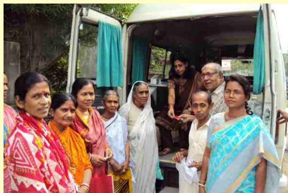
Mobile medical unit in the slum