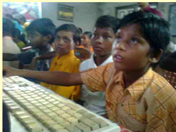
Child education – Ajim Premji Foundation