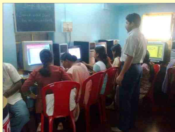
BPO Training Centre