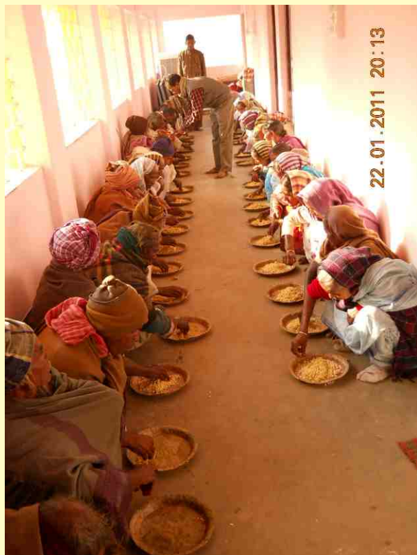
Meals being served