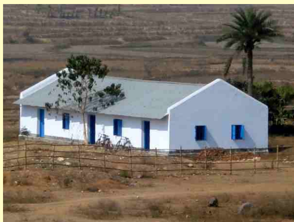
Saradamani Nivedita Siksha Mandir