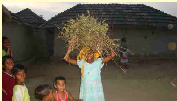
Collecting much needed firewood