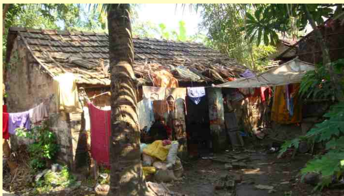
Slum at Kamarhati

Mobile Medical Unit is run in collaboration with Helpage India, in the slum of Kamarhati -For aged men & women (>60 years), Once a week. Medical advice is given with free medicine distribution mostly for BPL category with low cost Pathology Investigations at 50% market rate. This Unit caters for about 500 patients a month.