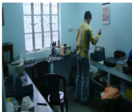
A Low Cost Diagnostic Division of Nanritam