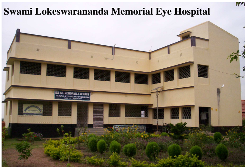
Swami Lokeshwarananda Memorial Eye Hospital