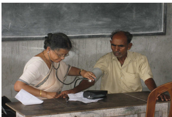
Medical Camp at Para , Purulia

This year, on 7 th November 2010, Nanritam had conducted a special 7-day medical camp at the remote Advaita ashrama Hospital, Mayabati, District- Champawat run by Ramakrishna Mission.