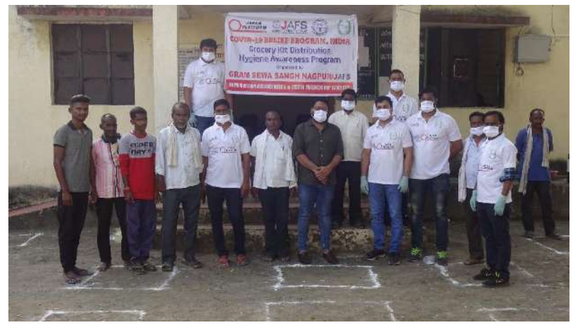
GSS Staff and Volunteer along with Resource Person