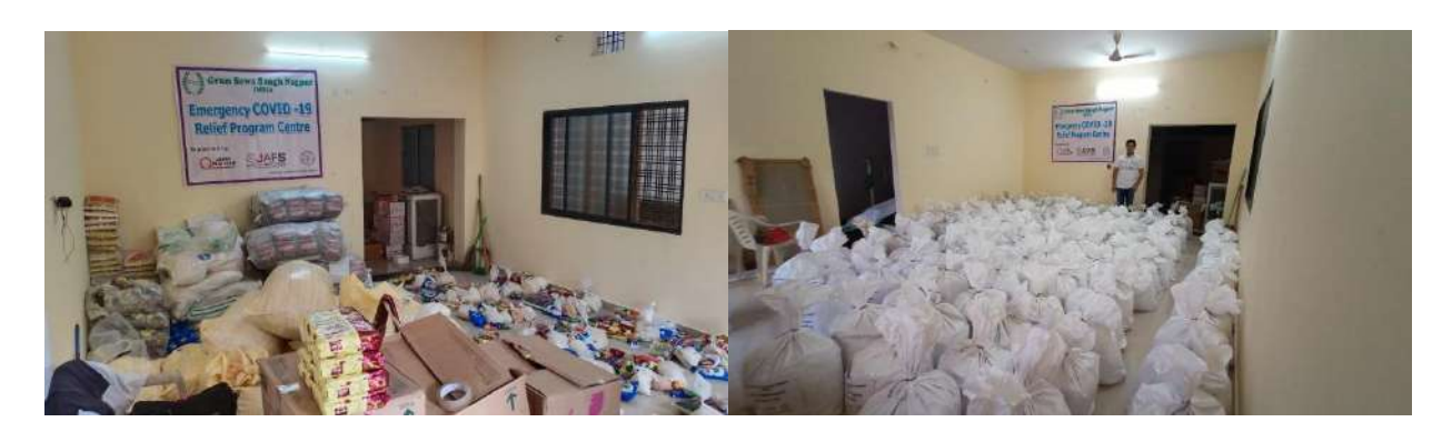
COVID 19 Relief Program for Shivaji Nagar Slum/Village Monitoring Survey Report Monitoring at Shivaji Nagar Slum/Village

People are facing uncertain and difficult times in the face of the Covid-19 pandemic. To support the affected families, we have converted our office into temporary Covid Relief Program Centre where we have done all the planning, meetings related to the program. All the grocery items and preventive kits were delivered at our center and then the team members of GSS/JAFS arranged the grocery items into grocery kits.