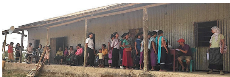
Medical camp at Sakhan Area (Serhmun-2 & Kasithai), North Tripura. No. of patients: 313