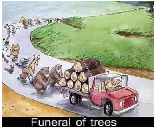
Funeral of trees

No.06, Sri Sai Dhama, Divine City, M.G. Road Ganganamidde ward Chikballapur-562 101 KARNATAKA INDIA