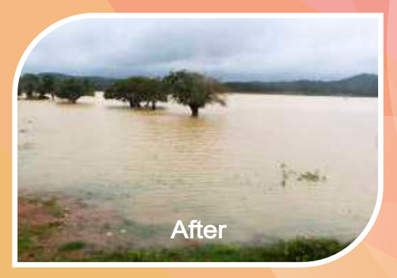
164 Acre Gudnapur Lake Under Construction