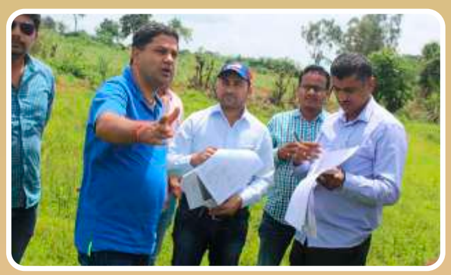
Representatives from Coca Cola Foundation Monitoring the lakes before rejuvenation