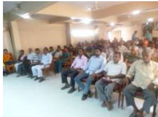
Block level FPC members training at Sirsi