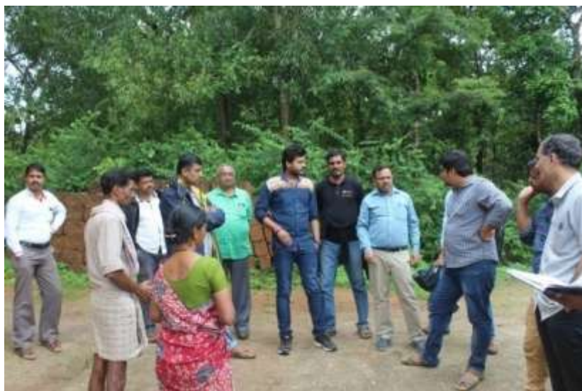
TATA trust representatives visit