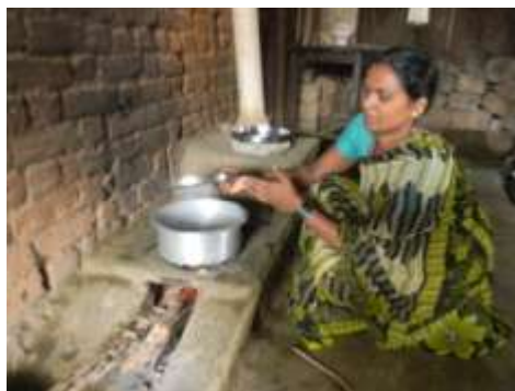
Cooking of food using fuel efficient stove