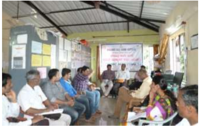
Project Implementation and Monitoring Committee meeting