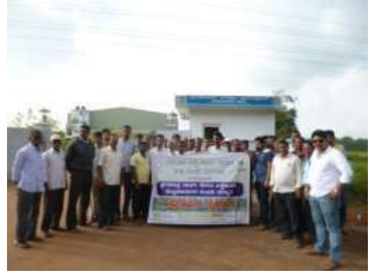
Exposure trip to the FPC members to the Areca processing centre, Bulk storage and pepper plantation in Shivamogga district