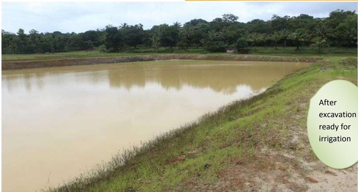
After excavation ready for irrigation