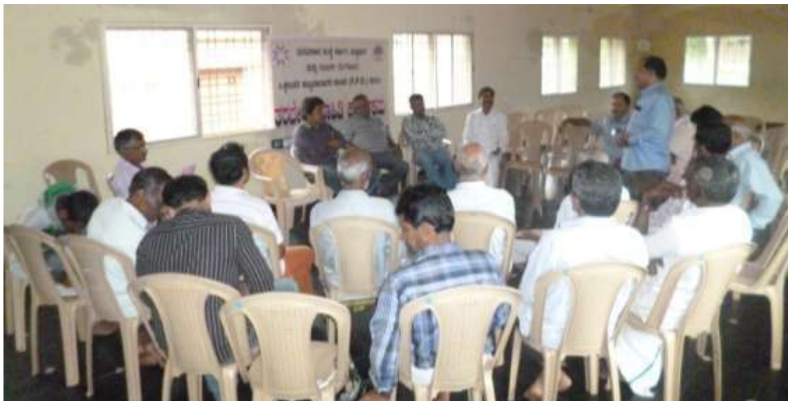
Cluster level meeting of FPC at Siddapur