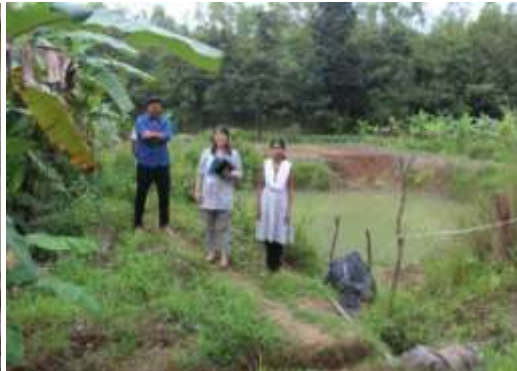
Ms. Swarnamayee from UNDP GEF SGP attended staff meeting and visited activity spots