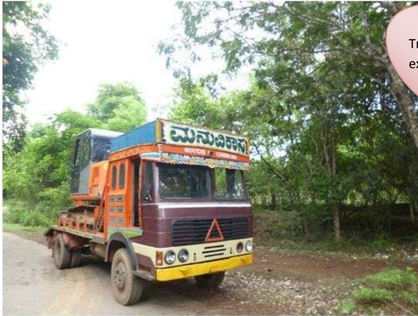
Transportation of excavator