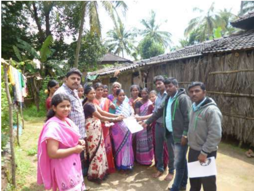
We provide service at door step through co-operative