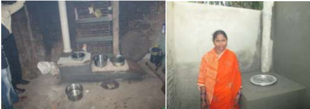
Photo of Kitchen stove and Bath stove