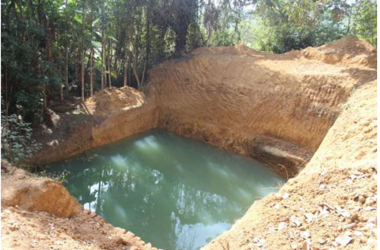
A farm pond constructed in Sonda village by MANUVIKASA