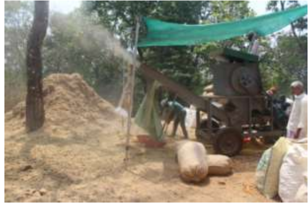
Activity spot of the FPO and areca de-husking machine