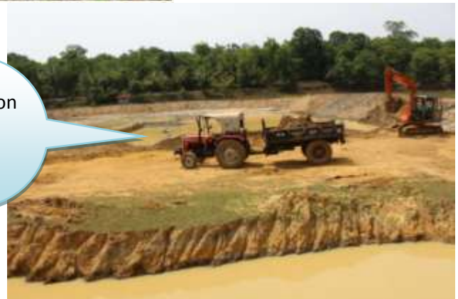
Excavation & soil shifting