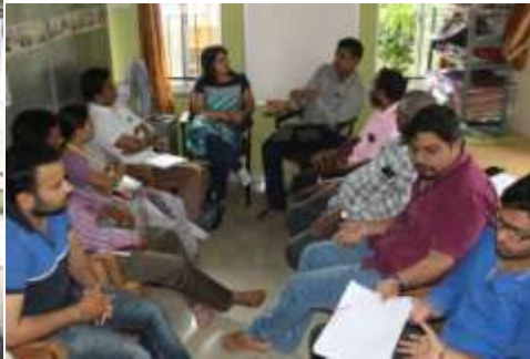
NABFIN officials discussing with staff and EdelGive Representatives attended staff meeting