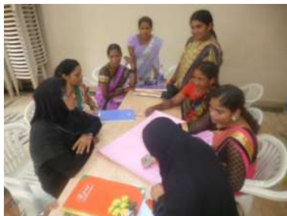
SHG training programme and group discussion