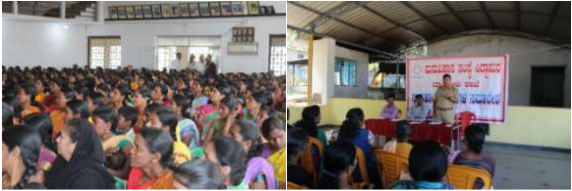
Annual federation meeting of SHGs in Sirsi and legal awareness programme in Dandeli

MANUVIKASA has started JLG (Joint Liability Groups) promotion with the help of NABARD since three years. Total 1148 JLGs are promoted and 1148 JLGs are linked with the bank loan of Rs. 16.22 Crores. Most of the groups are represented by women and are involved in different types of Income Generation activities. Each member of the JLGs has got an average loan of Rs. 40000.