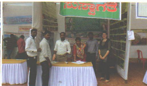
Farmers with the Krishi Sinchana awards (left photo); Manuvikasa staff with volunteers at their stall at the annually held Krishi Sinchana mela at (Hubli) Hubballi.

beneficiary from the project. This amount will be recovered by the beneficiary in one year through monthly recovery. Again that amount is given to new beneficiary in the same model.