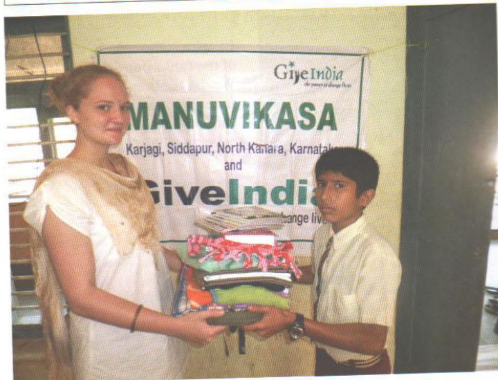
A student receiving a study kit.