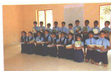
Students with books and other school and study material (seen in both the photos)

Choolha development Model MANUVIKASA is developing choolhas in Siddapur taluq of