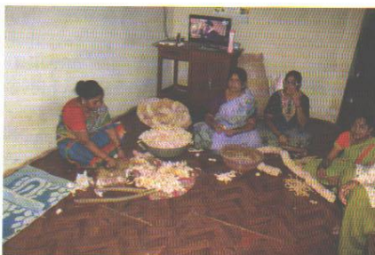
Women gainfully employed and (in the above photo), they are seen making garlands in their houses.

Lot of discussion happens on various issues which enhances the income of the farmers in a sustainable way.