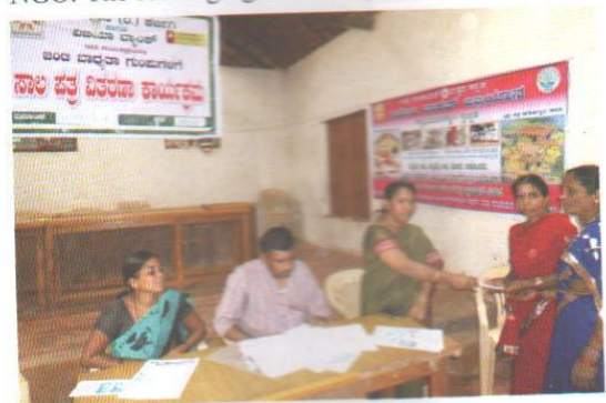
Loans being disbursed by the NGO to women's groups for their social welfare and upliftment.

The NGO is helping poor people to get loan from banks and Pragatimitra Cooperative Societies. The beneficiaries availed of loans and started poultry, small shops and other occupations for generating gainful employment and also supplementing their incomes. All this has happened with loan distribution right at their doorsteps. Some of them have purchased autos through loan support efforts initiated by the NGO. The recharging of the depleted water sources