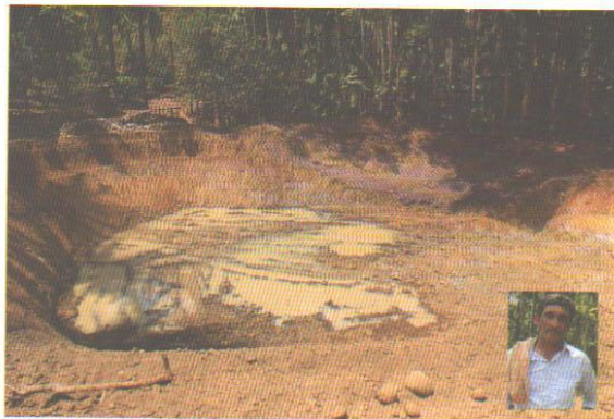
Tanks dug up for water conservation and for agricultural purposes (seen in both the photos).