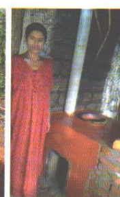
Energy efficient choolas (closed stoves) seen in both the photos.