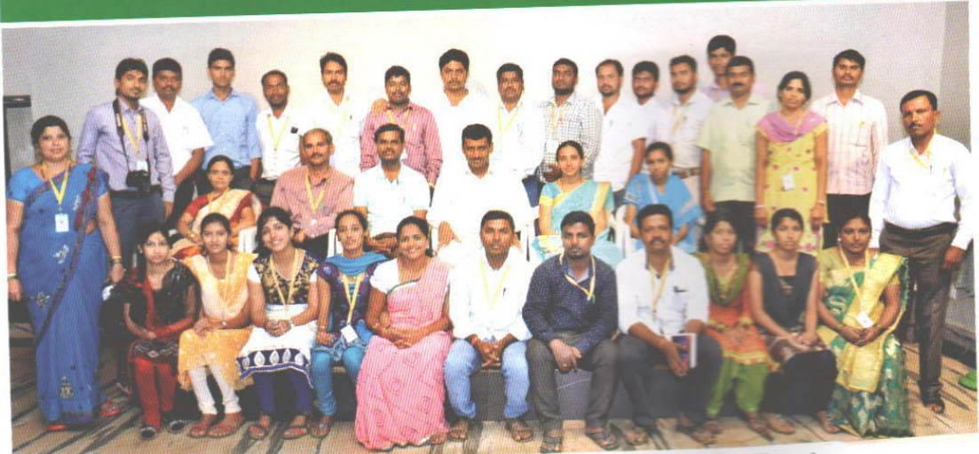
The staff of Manuvikasa, an NGO based in Sirsi and active in Sirsi-Siddapur and Haveri regions of North Karnataka (seen in the above photo).