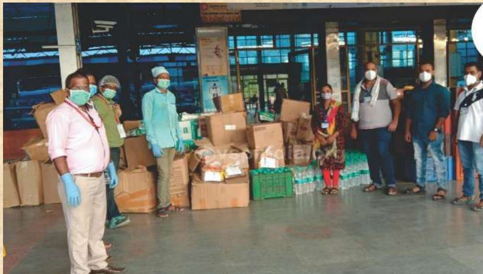
VSP taking care of labours travelling back home