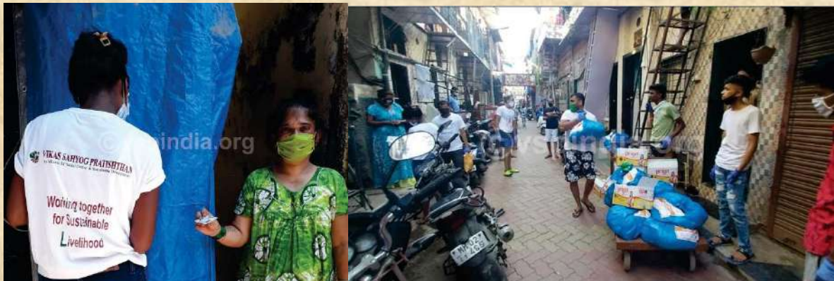
VSP provided Dry Ration Kits -

As COVID restrictions disturbed the lives & livelihoods of the people in the economically weaker sections of society, VSP took an active role in distributing free 7724 dry ration kits to people residing in the ABC slums of Mumbai