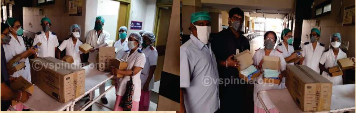
VSP distributed PPE kits to the frontline workers -

Hit by lockdown, stranded on roads the daily wage labourers, who live from hand to mouth, are struggling to make ends meet as the COVID-19 lockdown has been a setback in the usual routine. Hence to rebuild their lives VSP has supported 2000 labour travelling back to their home town with 2000 kits including basic hygiene essentials, snacks & water etc.