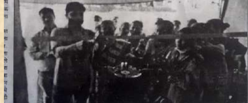
आवृत्तीत येथील सतर्कता सप्ताहनिमित्त आयोजित कार्यक्रमांला वेलदूर गावच्या महिलांला उत्स्फूर्त प्रतिसाद मिळाला. वेलदूर ग्रामपंचायतीच्या सभागृहामध्ये झालेल्या या कार्यक्रमांला परिमार्गदर्शन देणारा, बँक सखी, महिला बचत गट अध्यक्ष आदी स्तरावरील सुमारे ५० नेतृत्वशील महिला प्रतिनिधी उपस्थित होत्या.