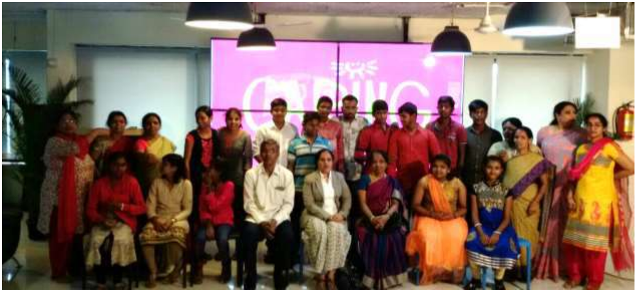
The team, Doctors, and survivor children at the Scholarship Program on 25 March 2018