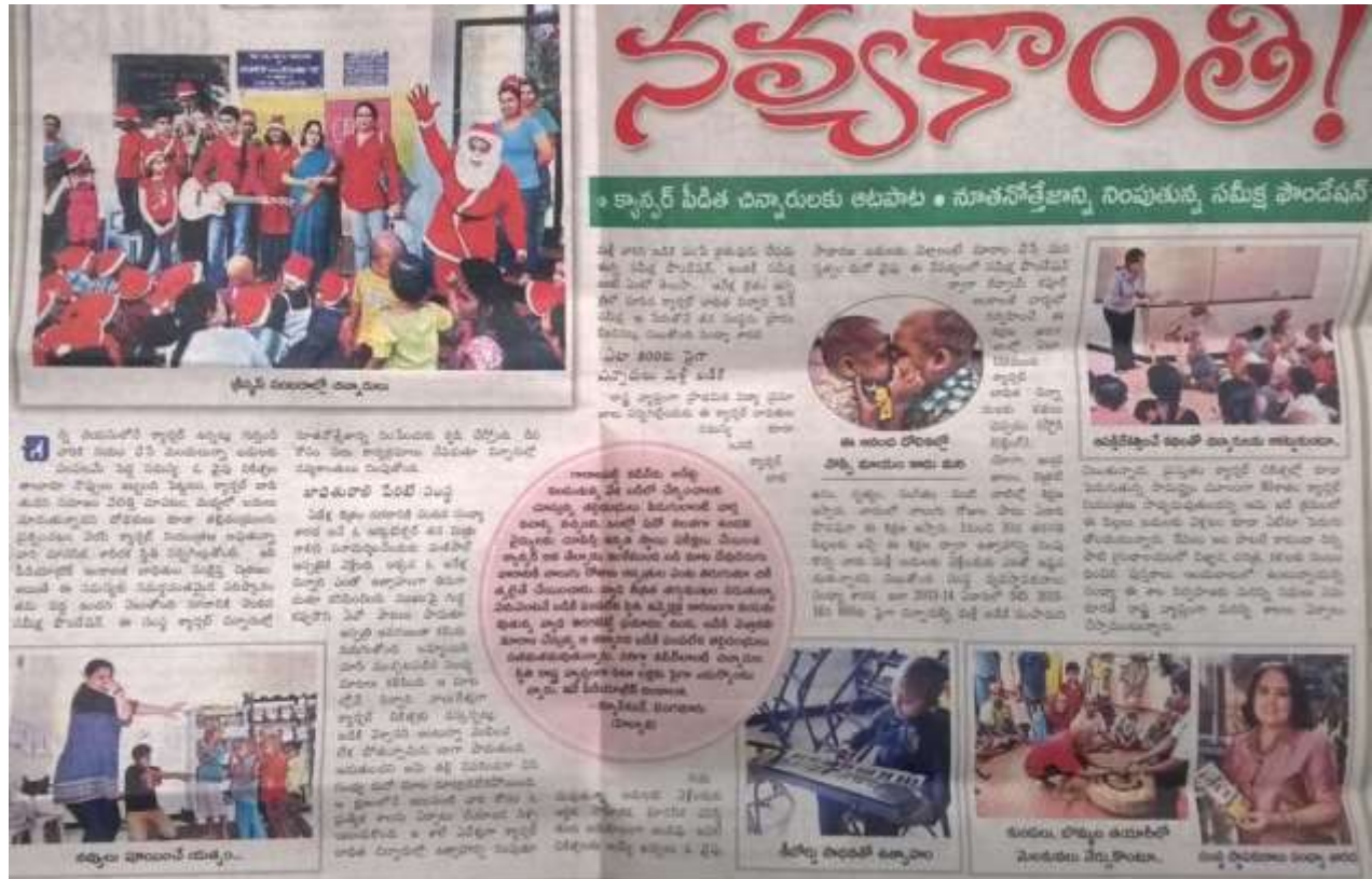
EENADU INDEPENDENT JOURNALISTS WORDS- APRIL 2016