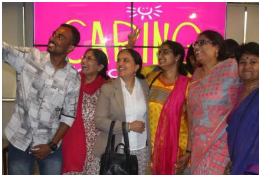
Selfie taken with a scholarship Student and Samiksha Ambassador