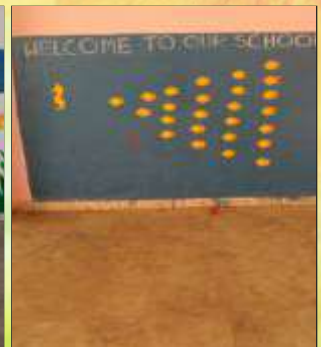
Teaching learning aids made by volunteers in Daultabad centre.