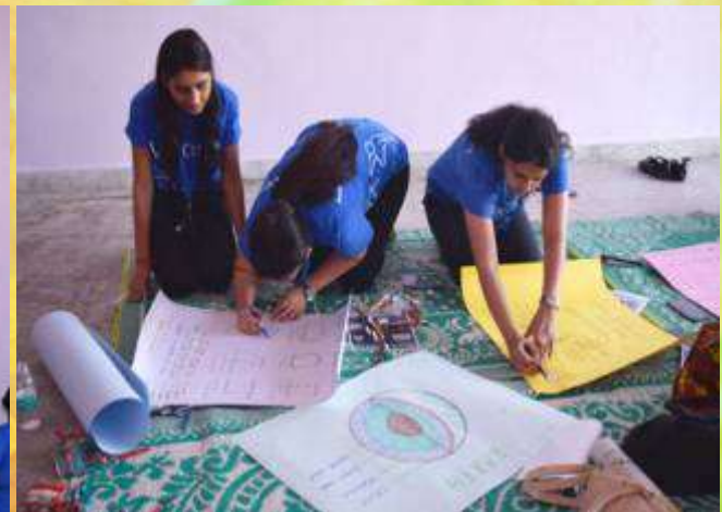
Volunteers are making teaching learning aids.