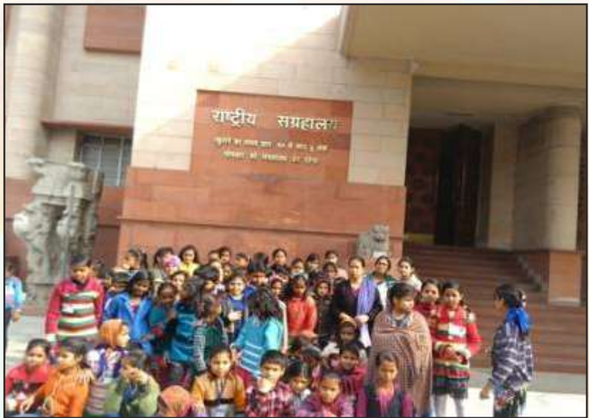
Children on educational tour.