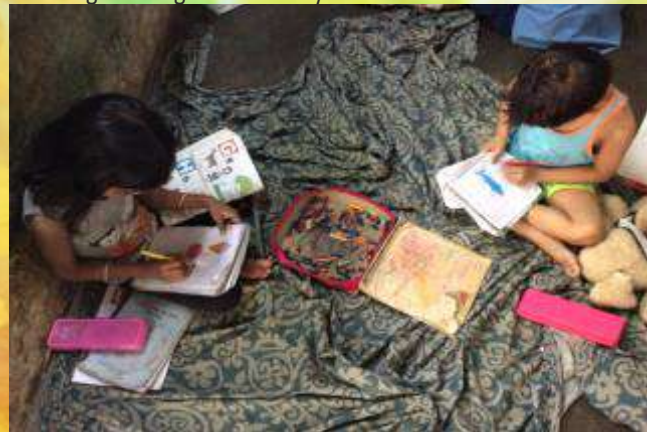
Children are drawing