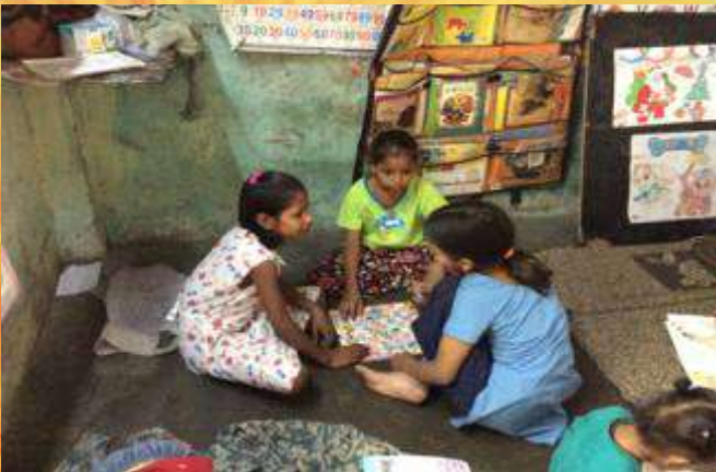
Children are playing