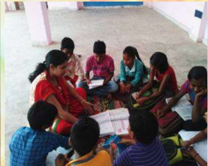
Classroom scene from Bajghera and Daultabad