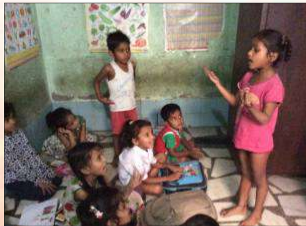
Child is reciting a poem

CSSAR is associated with ivolunteer which helps us greatly in volunteering.