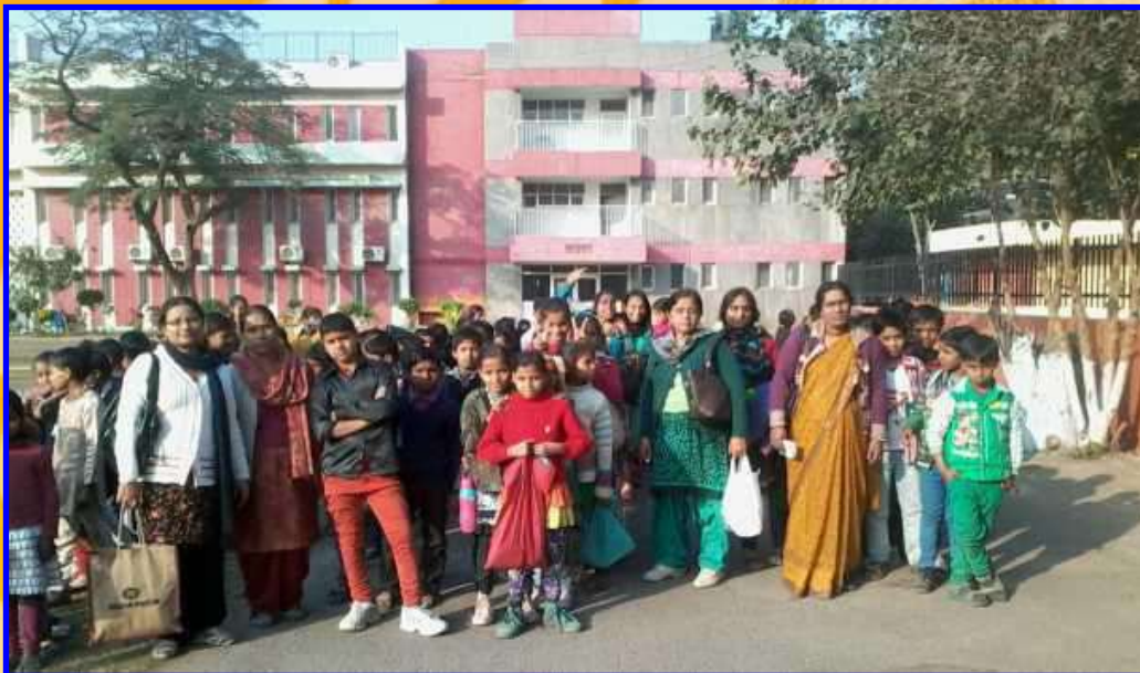
CHILDREN AT BAL BHAWAN

CSSAR is associated with ivolunteer which helps us greatly in volunteering.