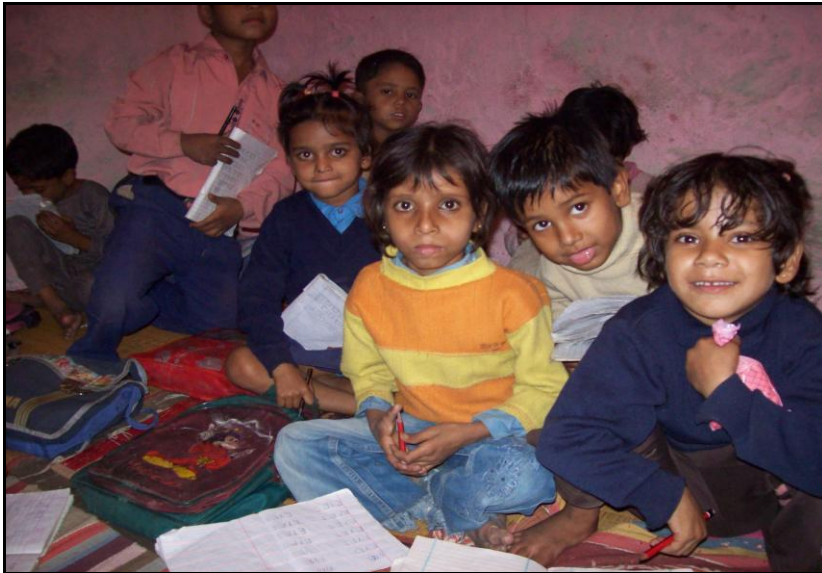
Young students in a class room

The program targets children in the age group of 4-5 years. Akshar Bodh is one year of basic preparatory education. The program, apart from motivating parents, prepares children for gaining regular admission in class I in municipal schools of their locality.